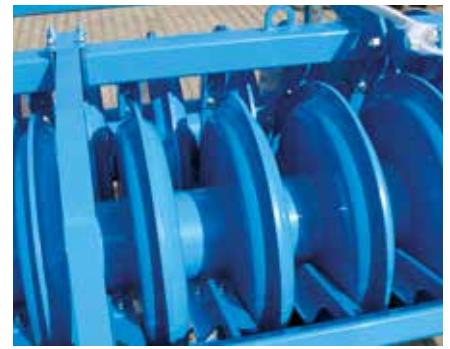
Packer double roller PDW 600/600

The packer double roller has two rows of rings designed to consolidate the soil at depth and is ideally suited for use with a semi-mounted Karat. The rings leave soil ridges, allowing a weathering process on heavy clay soils.