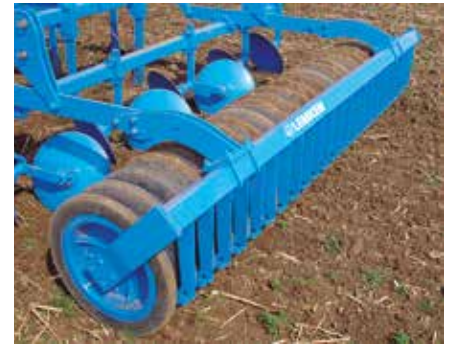
Rubber ring roller GRW 590

The rubber ring rollers consist of individual rubber rings set 125 mm apart. The rollers can be used together with a seed drill, with 125mm row spacing, to consolidate soil in line with the seed rows.