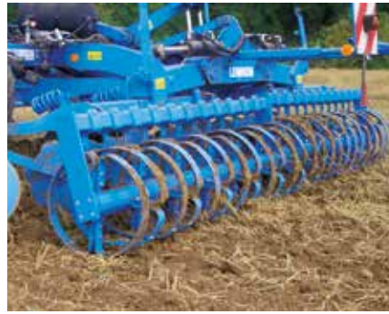
Flex ring roller FRW 540

The reduced rolling effect, of the flexible steel sections, makes the flex ring roller especially suitable for wet heavy soils, which tend to be sticky. The weight of the roller is ideally suited to mounted machines.