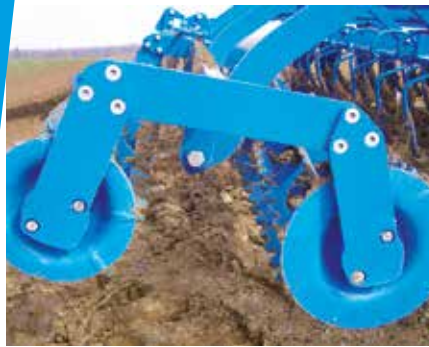
Tooth bar crumbler