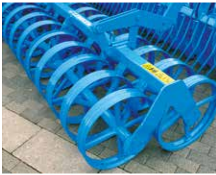
Double profile ring roller DPW 540/540

The dual-profile ring rollers have a diameter of 540 mm and they excel on account of their high load-carrying capacity on light and medium soil.