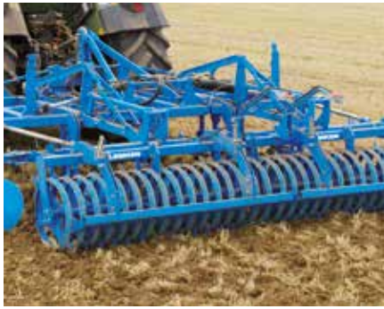
Knife roller MSW 600

The knife rollers are made up of rings set 125 mm apart.