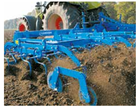
Tube-tooth bar crumbler