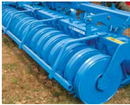
Packer profile roller PPW 600/540

When cultivating down to a depth of 30 cm the soil is intensively loosened and needs good reconsolidation throughout the cultivation depth.